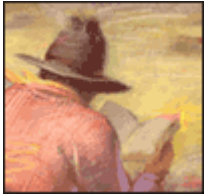
Their own list...