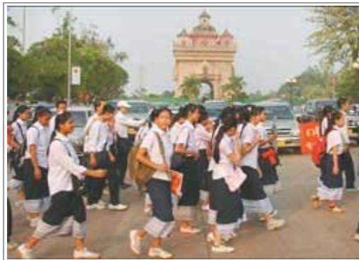
Schoolgirls in Vientiane. Tourists can travel to the Lao capital by train soon

A rail link between Thailand and Laos is scheduled to open this May.